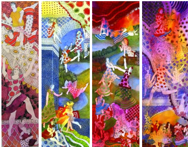
water colour on paper.