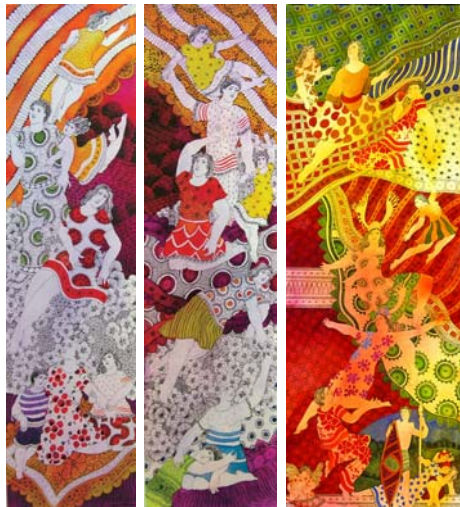
water colour on paper.